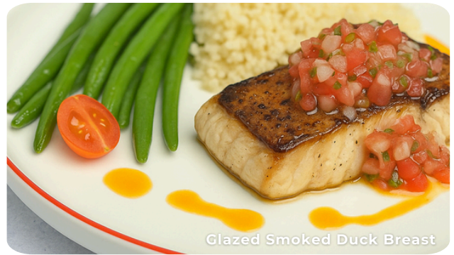
Glazed Smoked Duck Breast

Mushrooms, truffle, onions, rocket salad.