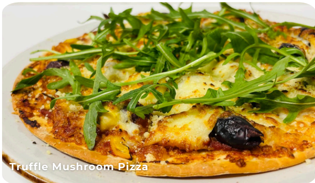
Truffle Mushroom Pizza