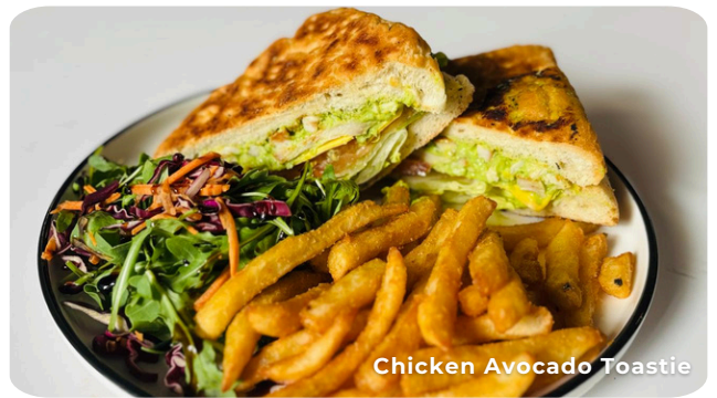
Chicken Avocado Toastie